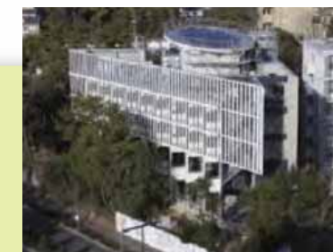
Disaster Mitigation Research Building

Although earthquakes of Intensity 3 (Japanese Scale) or below occur several times a year in Nagoya, there is no need to worry about such small earthquakes. This guide explains the precautions to be taken in case of a major earthquake of Intensity 5 or more. Such earthquakes occur approximately once every 100 years.